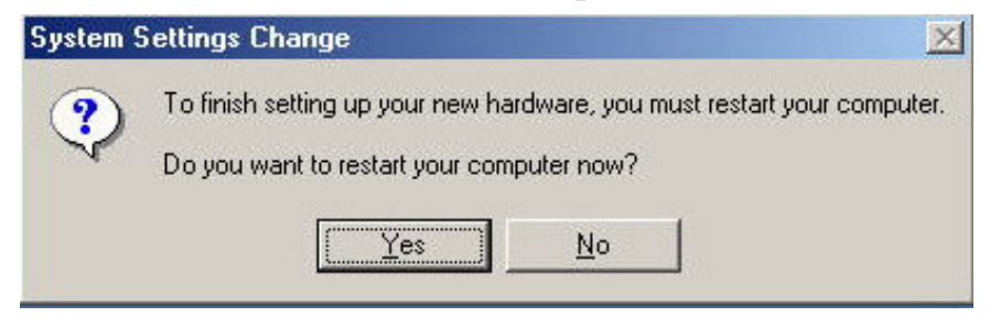
User Manual Version 1.0